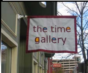
The TIME Gallery located on 47 Portland St.